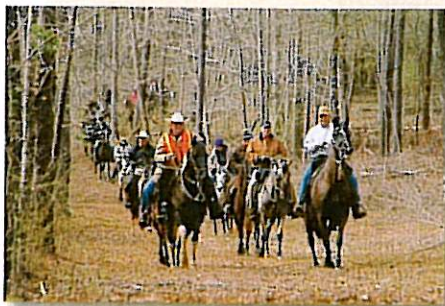
The Heart of Dixie Trail Ride, located in Troy, Ala., received high marks from trail riders on HorseTrailDirectory.com.

For more information, visit www.horsetraildirectory.com .